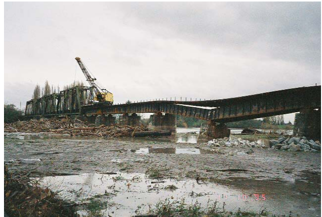
1995 Skagit River Flood – BNSF Bridge failure