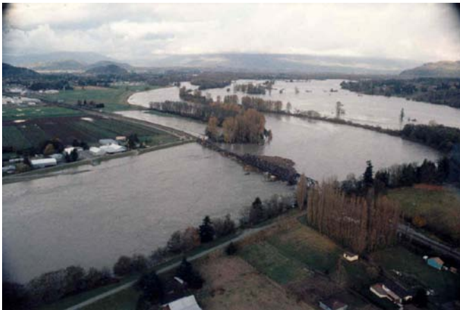
1995 Skagit River Flood – BNSF Bridge looking upstream