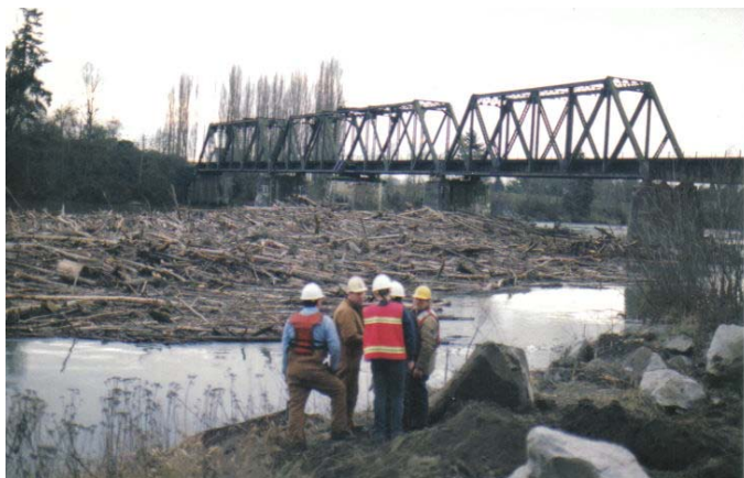
1994 Debris buildup