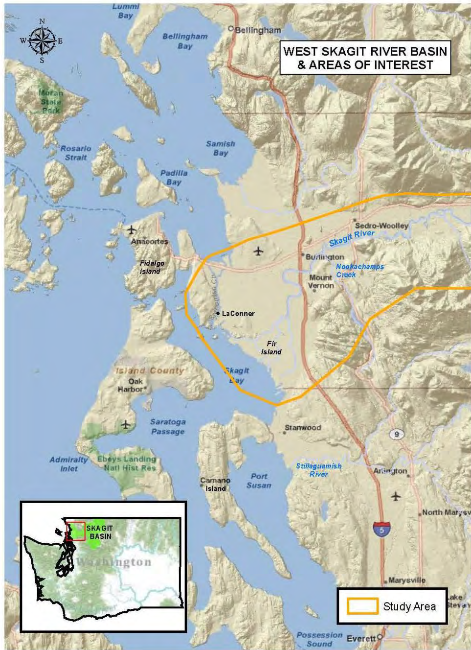
Figure 2. Lower Skagit River Basin and Areas of Interest