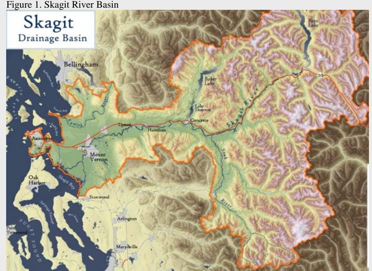
(Pacific Coast Watershed Partnership, 2008)

Despite the major alterations in the physical and biological processes occurring in the river system, the Skagit River still remains the major producer of salmonids in the northern Puget Sound. The delta is also a major wintering area for waterfowl and raptors, as well as a migration stopover for shorebirds.