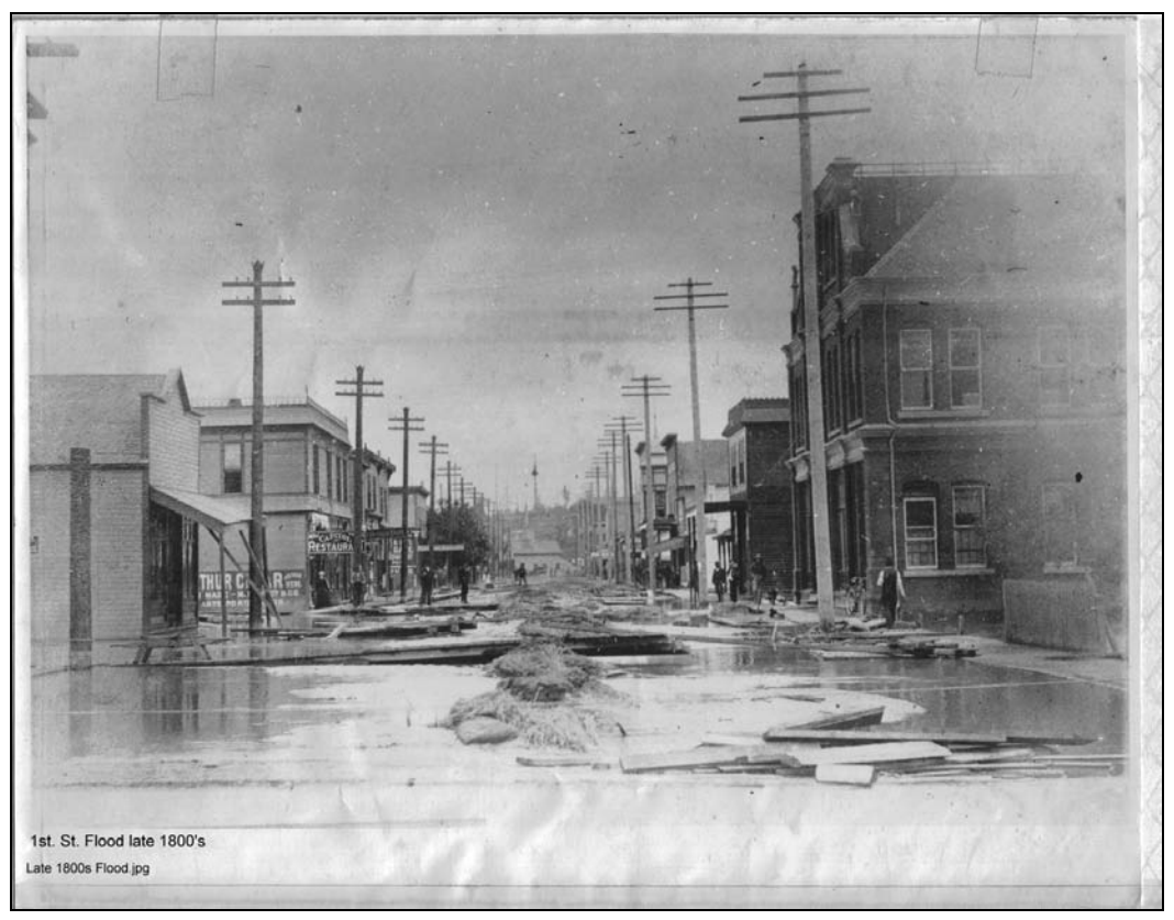
First Street, Mount Vernon, WA (late 1800s)

There are many stakeholders associated with this project. The following stakeholders have had direct involvement in the study: