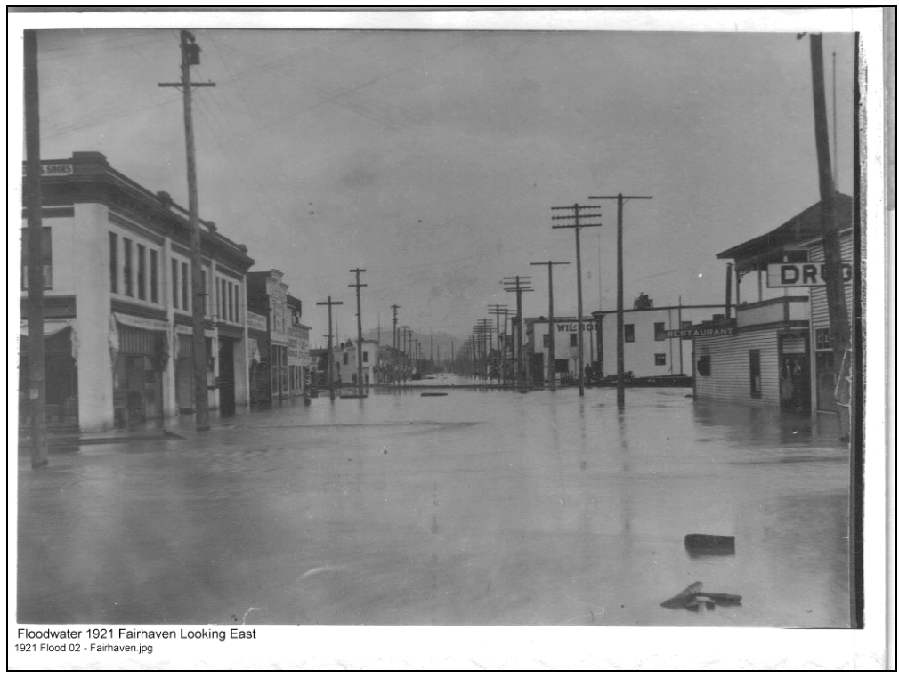
Fairhaven Avenue, Burlington, WA – Looking East (1921)

The purpose of comprehensive flood control management planning is to establish the need for flood control maintenance work, define structural alternatives, identify and consider potential impacts of in-stream flood control work on in-stream resources, and identify the river's floodway. (Skagit County, 1989)