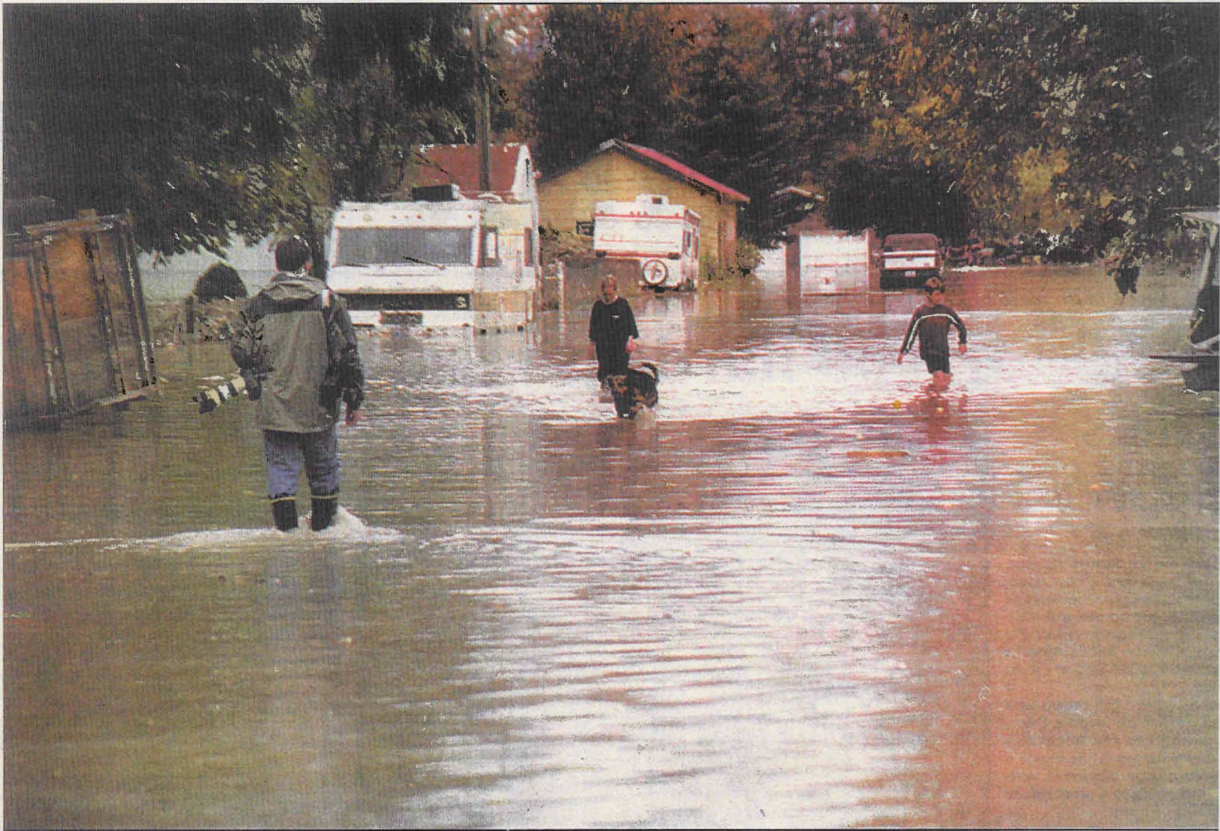
While a newspaper photographer watches at left, two Hamilton children and their dog wade in knee-deep water down their street last Wednesday.