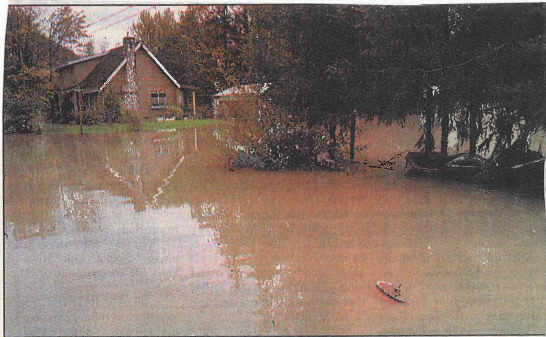
A bike tire sticks up from what used to be a street in Hamilton last Wednesday, as a home sits on a tiny island of elevation. Hamilton was one of the hardest-hit communities in last week's flooding.