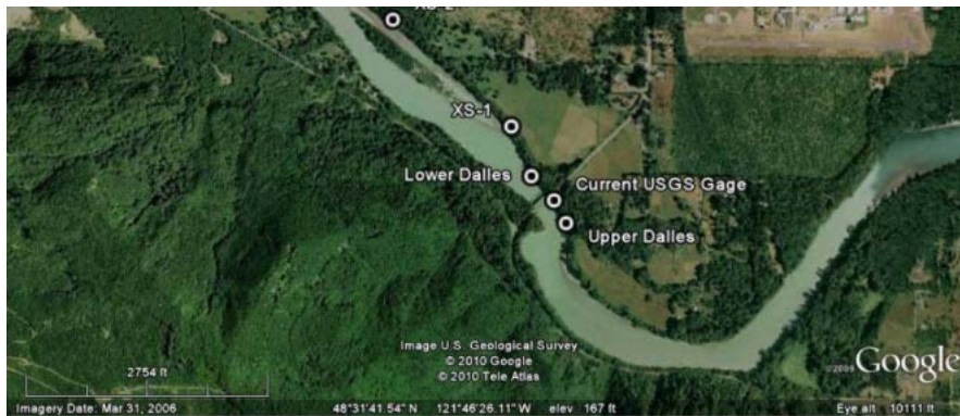
Figure 2. Location map of slope-area reach

COMMENT: There was a gage that was used by Stewart to determine the 1921 flood although it was upstream of the current gage. All other estimates of the 4 historical floods were taken over 2 river miles upstream of the current gage. (See nhc Re-Evaluation of the Magnitude of Historic Floods on the Skagit River Near Concrete Revised Final Report ) which states in part: